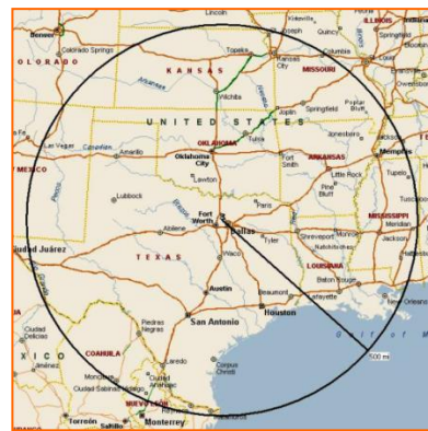
Fixed Wing Air Ambulance Service